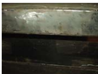
After surface preparation