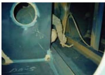
Careful stripe coating

Using our extensive world-wide network, CMP offer a free comprehensive ship survey in order to recommend the most cost efficient maintenance program for ship operator to implement.