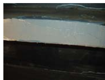
CMP NOVA 5000 BARRIER