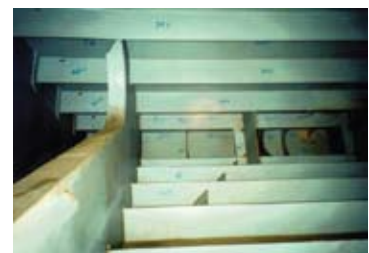
After 2.5 years