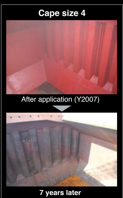
Good condition (no application on Tanktop )