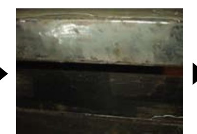
After surface preparation