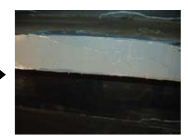
CMP NOVA 5000 BARRIER