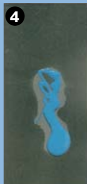
4 Water underneath the coating is completely excluded enabling a dry substrate for excellent adhesion.