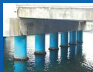
The condition after 11 years