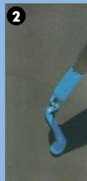
2 Apply PERMASTAR WE-300