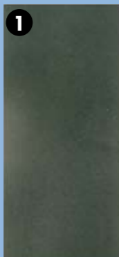
1 Wet steel plate