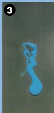
3 Water is gradually excluded